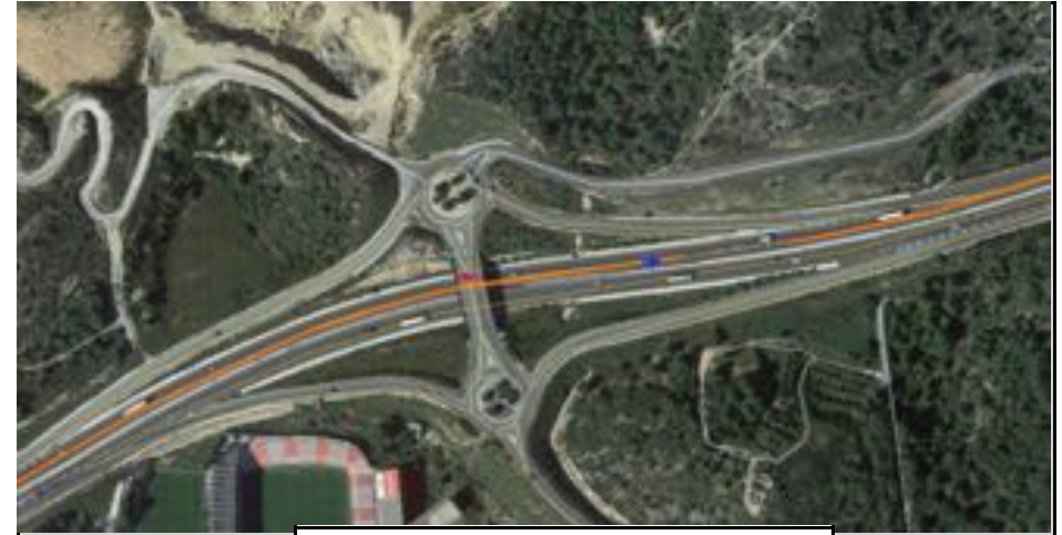
8 intersections with exit-entry and U-turn options, consisting of two small roundabouts