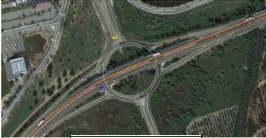
13 intersections with exit-entry and U-turn options, consisting of one big roundabout