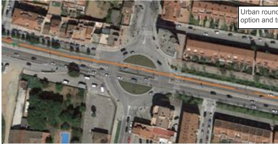
Urban roundabout with straight option and traffic lights.