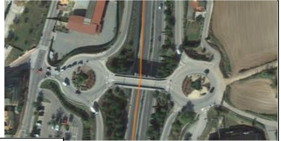
Different types of intersections with exit-entry combination or U-turn possibilities.