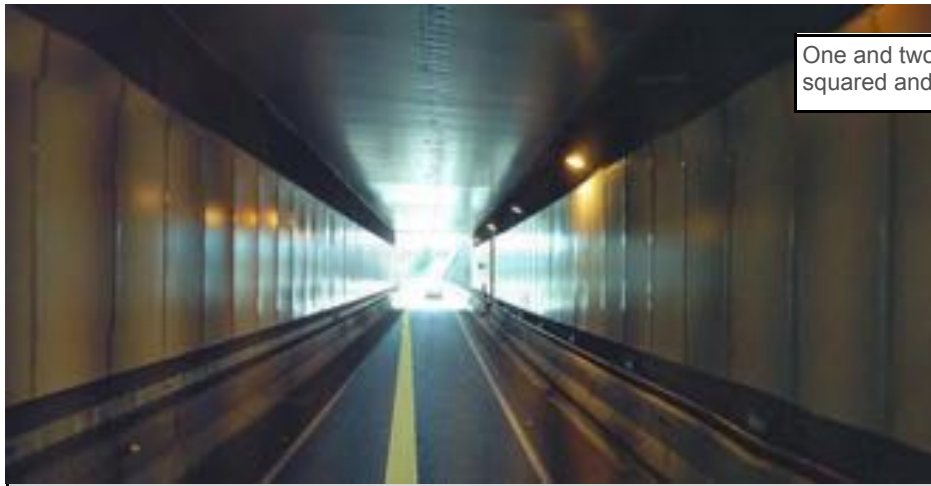
One and two lane tunnels with squared and rounded walls.