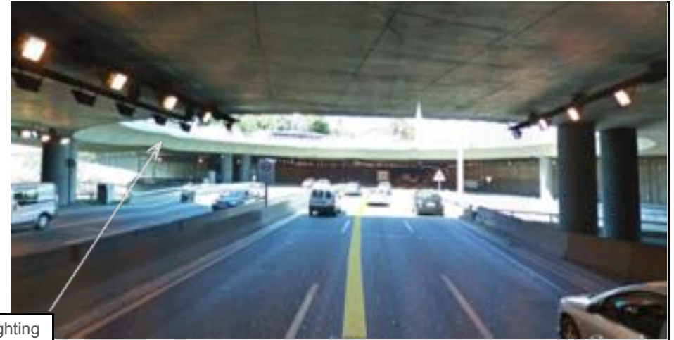
Varying lighting conditions