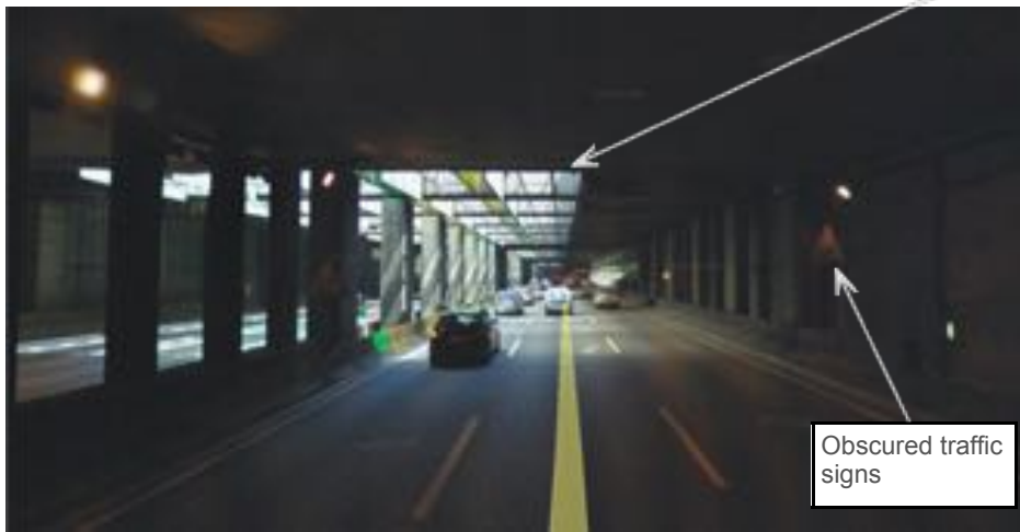
Obscured traffic signs