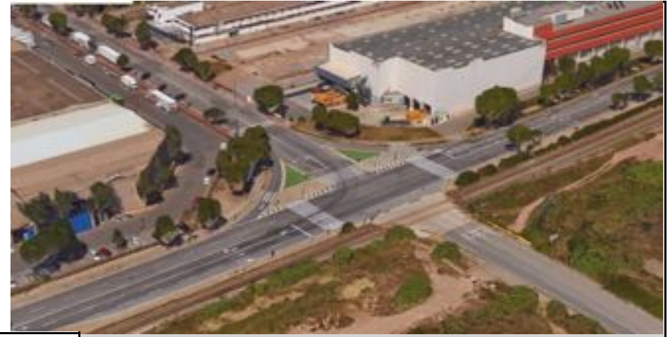
Wide variety of unusual intersections.