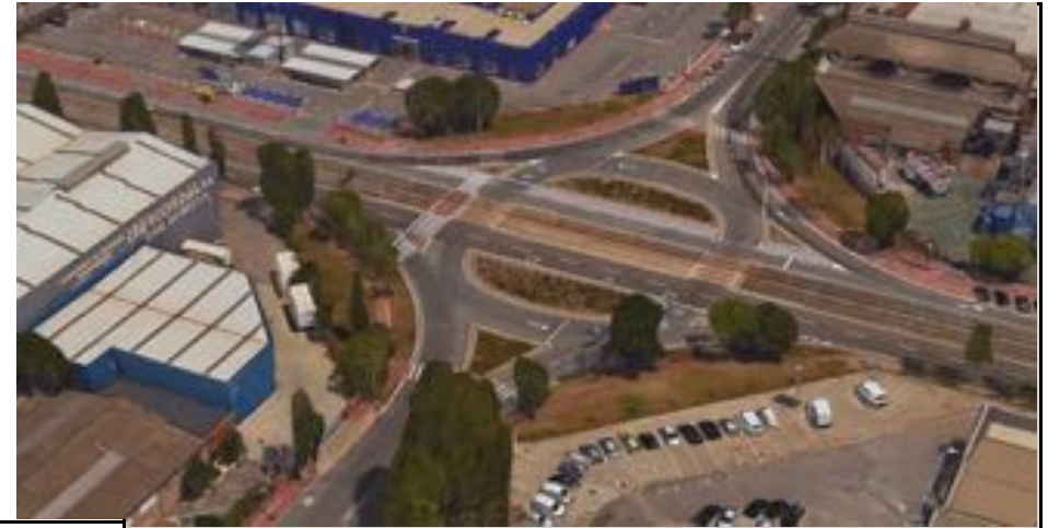
Wide variety of unusual intersections.